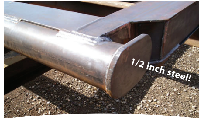
1/2" thick Cable Retainer Ends (above)

Custom sizing available Contact us to discuss your project needs