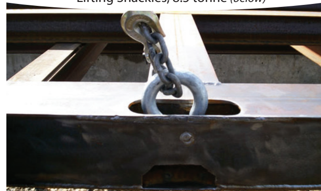
Lifting Shackles, 8.5 tonne (below)